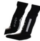
LSP black sport socks