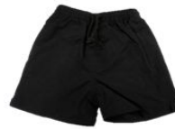
Black shorts (plain)