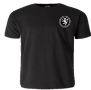
Indoor/Summer T shirt